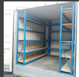
JLG 10ft – Container Storage Solution