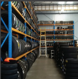
Herb Morgan Tyres – Auckland Tyre Storage Solution