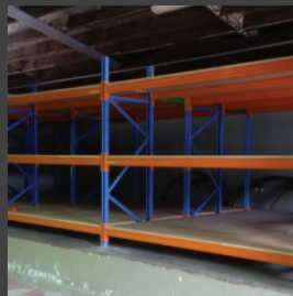
Sky City – Auckland Carpet Racking Solution