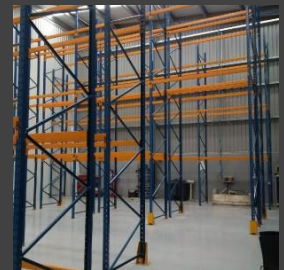
Auto Transform – Auckland Specialised Pallet Racking