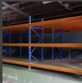
Sky City – Auckland Carpet Racking Solution