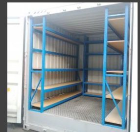
JLG 10ft – Container Storage Solution