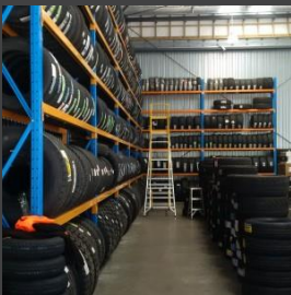
Herb Morgan Tyres – Auckland Tyre Storage Solution